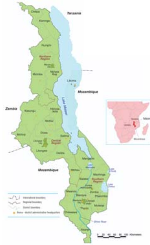
Figure 1. Main water bodies in Malawi (NSO 2005)